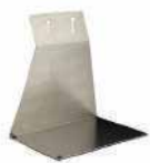
A813 Table Top Stand †