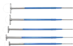
Lletz Loop Electrodes †