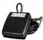
A803 Footswitch †